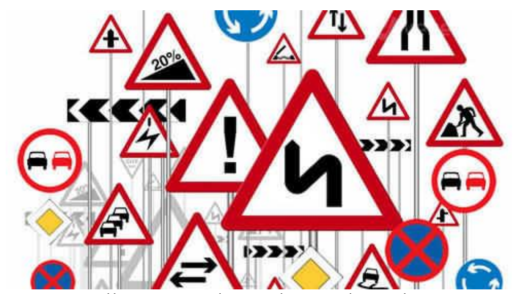
Figure 5. http://www.futas.net/hungary/Budapest/images/kresz-tablak.jpg

To summarise, the most important requirement for the problem of the image of the city is transparency. So we need objective, clearly visible signs not just to use them but to understand the city. These signs must be understandable for everyone, thus they must be visual.