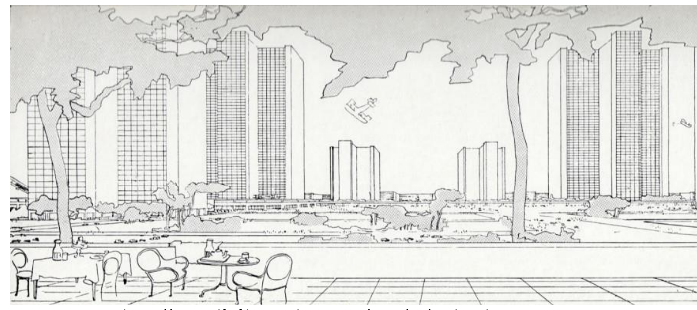
Figure 2. https://rosswolfe.files.wordpress.com/2014/06/40_lecorbusier1.jpg

The residential blocks, of the two main types already mentioned, account for a further 600,000 inhabitants. The garden cities give us a further 2,000,000 inhabitants, or more. In the great central open space are the cafes, restaurants, luxury shops, halls of various kinds, a magnificent forum descending by stages down to the immense parks surrounding it, the whole arrangement providing a spectacle of order and vitality." [16]