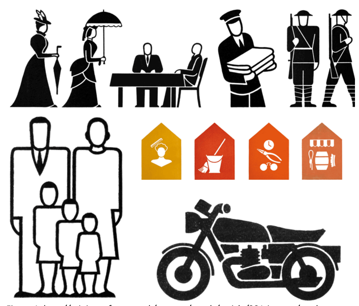
Figure 1. http://ministryoftype.co.uk/content/words/article/281-isotype/gerd-arntz.png

not only in philosophy but also in architecture – in the name of a modern way of life. This whole community shared the same ideological criteria. [5] It is well known that Neurath gave lectures at Bauhaus. [6] "Neurath's collaboration with the Bauhaus was based on a mutual scientific approach, as well as his personal interest in arts, architecture and workers settlements, as shared by others in the Vienna Circle. The mutual envisioning of a modern society was strengthened by both groups' opposition to existing nationalist, anthroposophist and metaphysical tendencies. After exchanging lectures between Dessau and Vienna, the two groups had developed such strong bonds that, after fleeing the Nazis, even the New Bauhaus in Chicago adapted logical positivism into its general design agenda. (68)"[7]